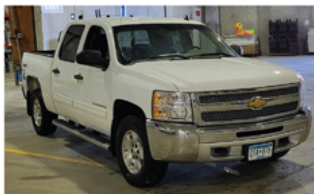
Winning bids for SWCE trucks

Steele-Waseca Cooperative Electric successfully conducted sealed bid auctions for their 2013 Chevy 4x4 Crew cab (pictured above left) and 2010 Ford F-150 4x4 SuperCrew cab (pictured above right). The minimum bid requested for the Chevy was $10,500, and the winning bid was $15,099.99. The minimum bid requested for the Ford was $8,500, and the winning bid was $11,111. The bids needed to be received at Steele-Waseca's office in Owatonna by noon, Wednesday, Jan. 3. The winning bidders were notified by phone by the end of the business day, Thursday, Jan. 4. Steele-Waseca is respecting the privacy of the winning bidders by not disclosing their identities. 17974