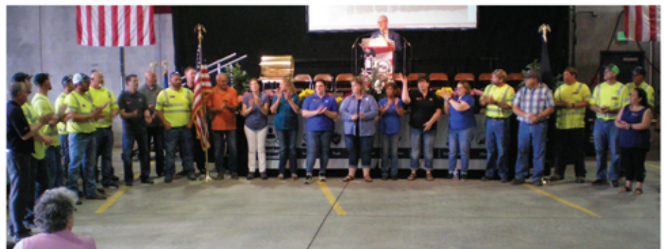
Steele-Waseca employees were introduced to members and guests attending the annual meeting.

(SWCE annual meeting continued on Page 8)