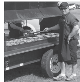
Staff with Hy-Vee in Owatonna will work the grill prior to the start of the annual meeting to prepare the smoked pork chops.

After the election results are announced, there will be a drawing for grand prizes, and the meeting will be adjourned. Following adjournment, a "buffet" lunch will be served by Hy-Vee of Owatonna featuring smoked pork chops, vegetables, potatoes, salad, dinner rolls, coffee, white and chocolate milk, water, and soda, with Dairy Queen Dilly® Bars for dessert.