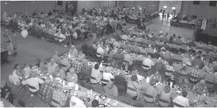
Steele-Waseca's 82nd annual meeting in 2018 was attended by 725 members and guests.

There will be two early bird drawings for prizes taking place prior to the start of the annual meeting. The business portion of the meeting will begin promptly