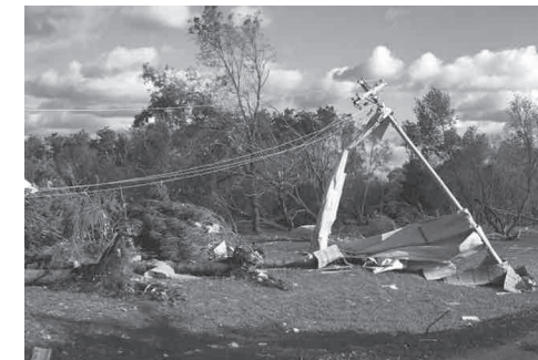
Pictured is a sample of the storm damage encountered by Steele-Waseca line crews in Rice County following the Sept. 20 storm.

Operations Division Manager Kim Huxford said the follow-up work as a result of the storm includes clean up and retiring damaged distribution system areas, straightening poles that are leaning, trimming and/or taking down