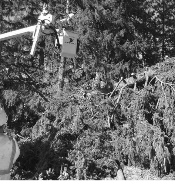
Line crews endured long hours and needed to clear an abundance of trees to gain access to restoring power.

When the crews were called in on Friday, Sept. 21, there were still 953 meter locations without power. By Monday, Sept. 24, the number was less than 200; and on Tuesday, the outages were less than 20, not including the