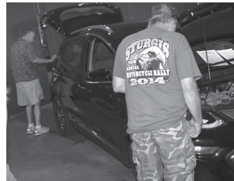
Those in attendance for Steele-Waseca's annual meeting had the chance to look over the electric vehicle on display provided by Great River Energy.