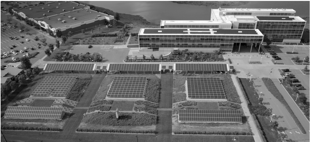
Great River Energy's solar garden is located at their headquarters in Maple Grove.

“These figures still represent that our ideal days are a low minority of the time,” Bergrud noted. “Knowing this