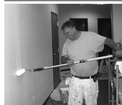
SWCE office getting painted

Since most private facilities are not listed on the GSOC, it is the homeowner's responsibility to hire someone to