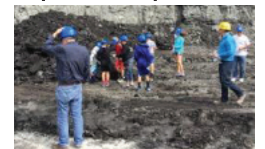
Coal Creek Tour participants had the opportunity to collect coal at Falkirk Mine.

On Wednesday, June 14, the day started with breakfast prepared by hotel staff. The first stop on the tour was at