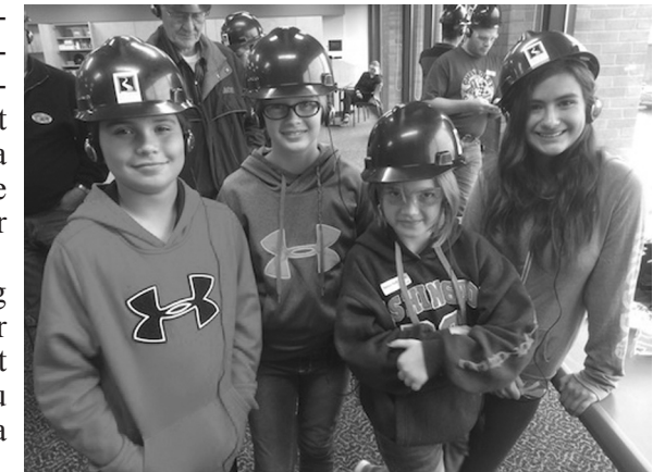
Parents and/or grandparents may bring up to three students, ages 10 to 18, at no charge. 101580