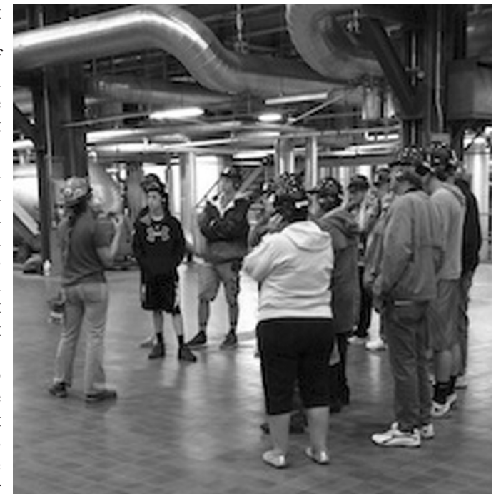
Tour participants in 2016 were divided into smaller groups for a guided tour of the Coal Creek Station.

For members wishing to travel for a second or additional time, the cost is $620. However, if you bring a guest who is a Steele-Waseca member, who has not been on the